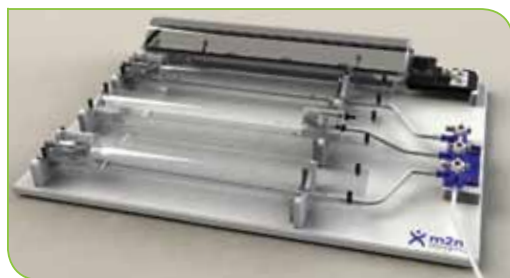
Rat Prep Table