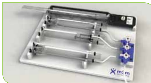
Mouse Prep Table